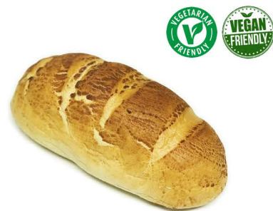
large tiger loaf 800g