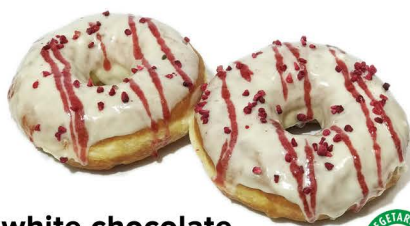
white chocolate & raspberry