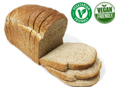
sandwich wholemeal 700g