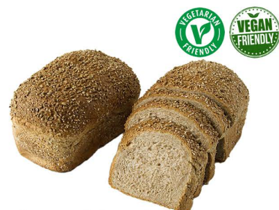
wholemeal farmhouse 800g