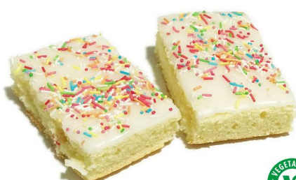
school sprinkle sponge