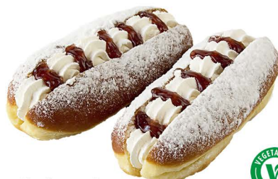
split jam & cream