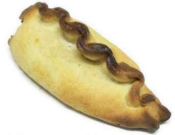
beef & vegetable pasty