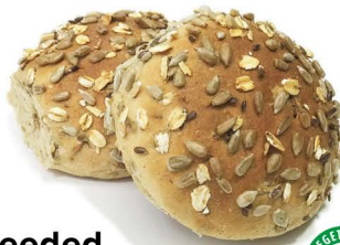
seeded granary rolls