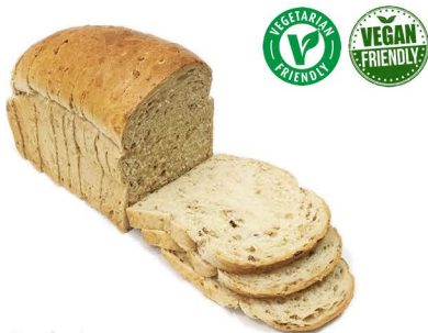
sandwich granary 700g