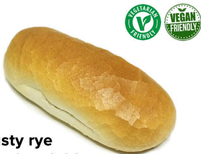
crusty rye sourdough bloomer 700g