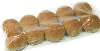
wholemeal dinner rolls