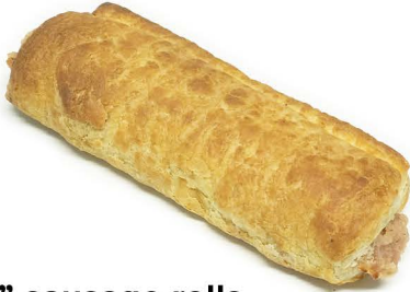
6" sausage rolls