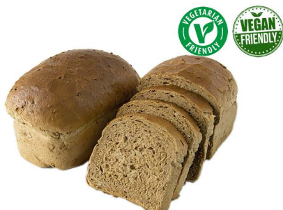
granary farmhouse 800g