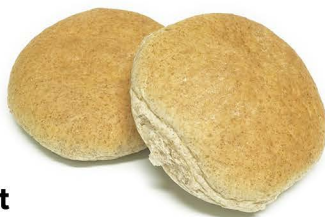
soft wholemeal baps