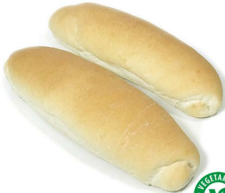
long soft white rolls