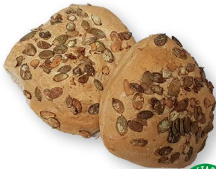
pumpkin seed roll