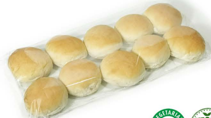
white dinner rolls