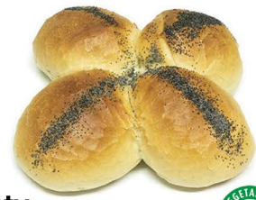
crusty poppy seed batch