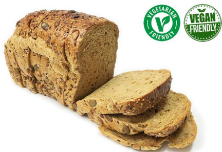
sandwich multiseed 700g