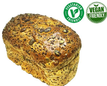
multiseed farmhouse 800g