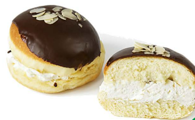
almond chocolate cream