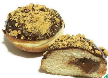
hazelnut, choc & ginger