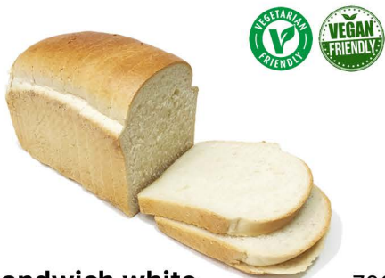
sandwich white 700g