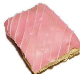
jam crem danish