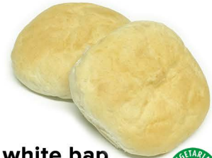
soft white bap