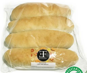
8" hot dog rolls