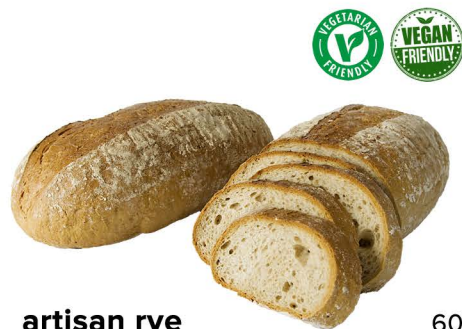
artisan rye 600g