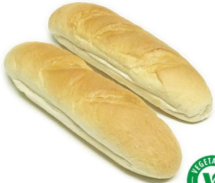
crusty white batons