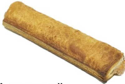
8" sausage rolls