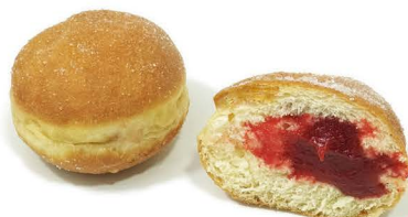
sugar topped jam ball