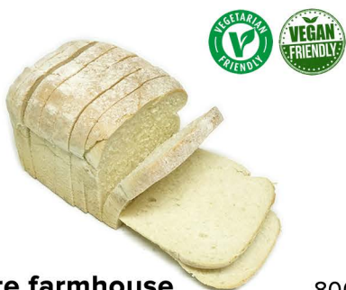
white farmhouse 800g