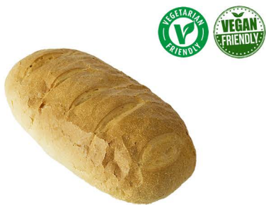
large white bloomer 800g